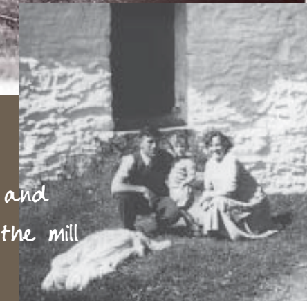
my parents decided to build a shop to supply the growing number of tourists that came to visit the mill