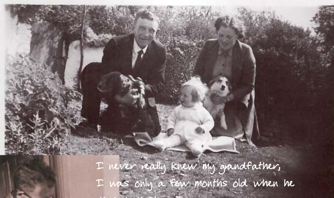
I never really knew my grandfather, I was only a few months old when he died in 1954