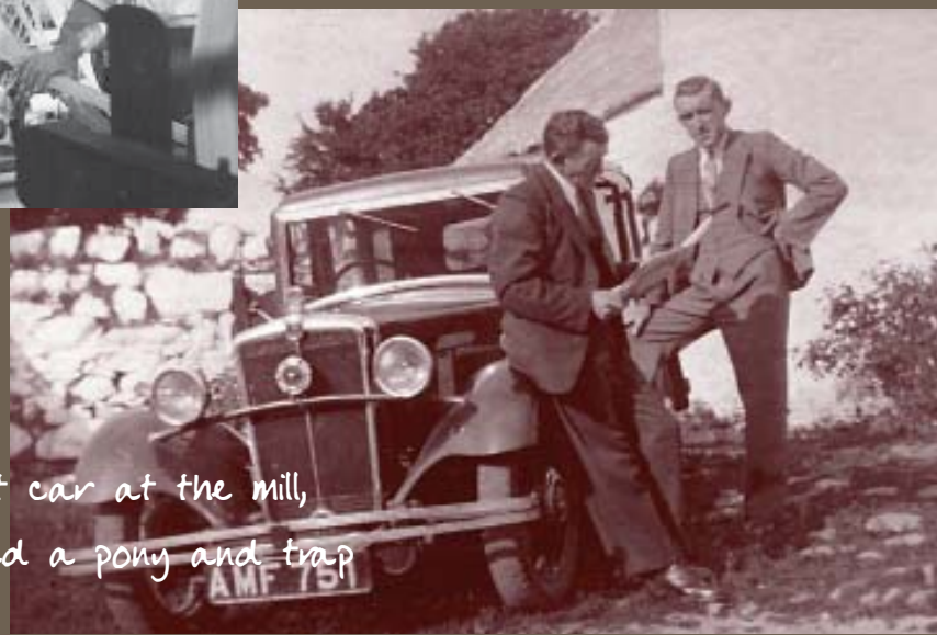
the very first car at the mill, which replaced a pony and trap