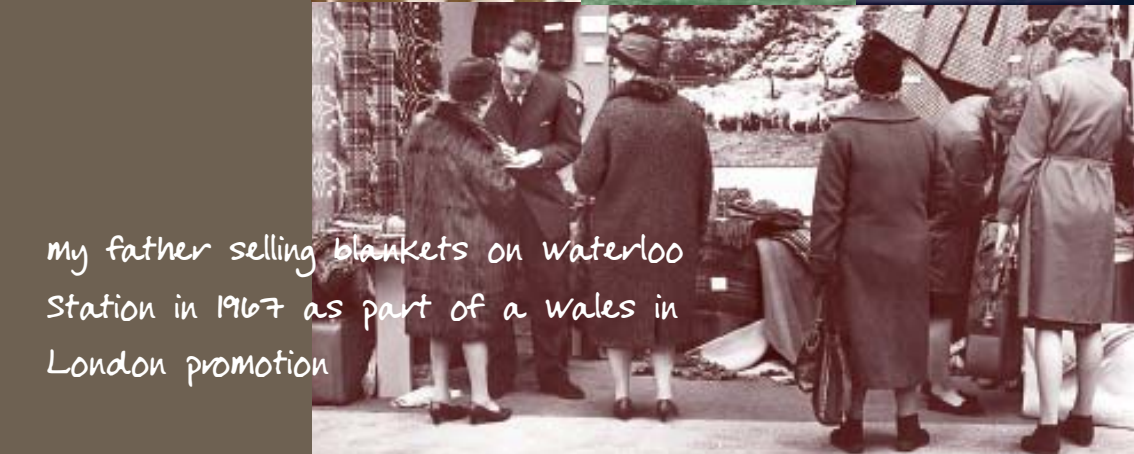
my father selling blankets on Waterloo Station in 1967 as part of a Wales in London promotion

you may have slept under our blankets, seen them on the telly or read about them in magazines