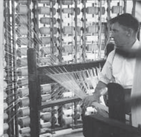
my father preparing a warp ready for weaving