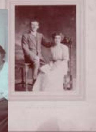
hanes teulu a family history