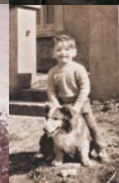
lassie and me helping to build the millshop in the 50s